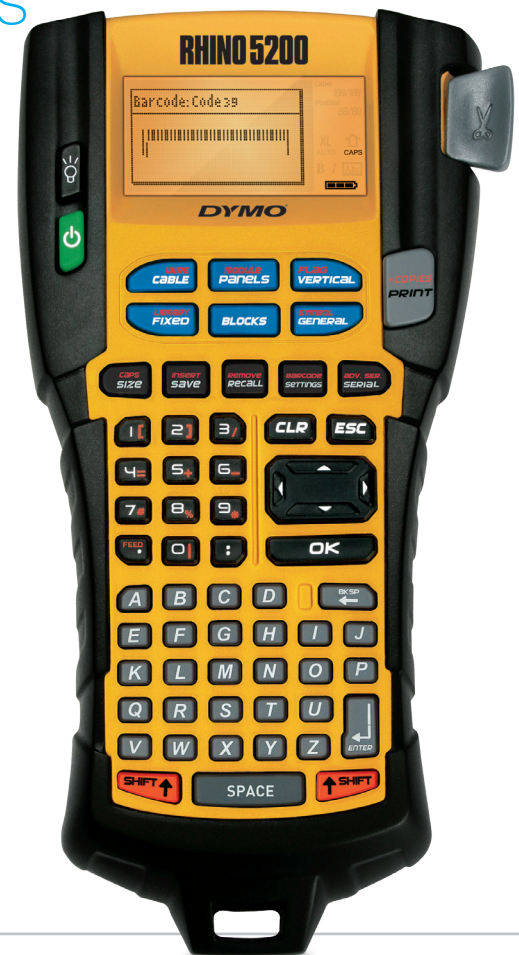
Hard Case Kit (see back for details)

It’s just as easy to print module and fixed-length labels, horizontal and vertical wire wraps, terminal and 110 blocks and much more. Print Code 39 and Code 128 barcodes. Access 100+ industry symbols, fractions and punctuation marks with a few quick keystrokes. Add the optional quick-charging lithium-ion battery for uninterrupted productivity.